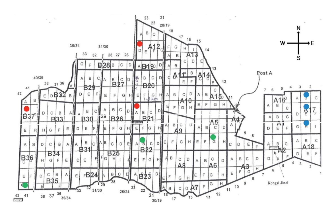
FIGURE 1. Map of Endau Rompin Plantation. A17B, A17E and A17H represent clay soil (blue), B36G, B22B and A5G represent shallow peat (green) and A12D, B21A and B37C represent deep peat (red)

The stand scouting method was applied, with each palm tree searched from ground level up to a 2-m level to detect the presence of termites. The survey of about 19,000 palm trees in nine blocks focus on searching of the presence of termite trail and mound on palm trees (for arboreal and epigeal mounds) including the fronds. Each tree took about 30 s to one minute of survey including the time for collecting samples and data marking. The scouting started from the first row of palm trees adjacent to the road and continued through the block boundary at the end of the rows of 30 palm trees. Each four rows of palm trees divided by field drain and four trained persons worked side by side and continuously scouting for 30 min for each