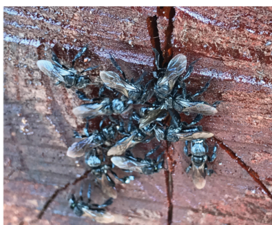
FIGURE 1. Heterotrigona itama bees

twenty-nine (29) stingless bee species was documented in Peninsular Malaysia and out of this, 17 species were known to inhabit the virgin forest. The most common meliponiculture species in Malaysia are Heterotrigona itama (Figure 1) due to the high demand and abundance. Heterotrigona itama is known as a pollinating agent for most of the crops in Malaysia. Meliponiculture is a term used for stingless bee keeping. The domestication of all Malaysian stingless bee species could not be achieved as some forest stingless bee species such as Tetrigona binghami (Figure 2) is resin dependent (Jaapar et al. 2016; Leonhardt et al. 2011). Removal of these species from the rainforest will collapse their habitat as there are no resources for their food and hives.