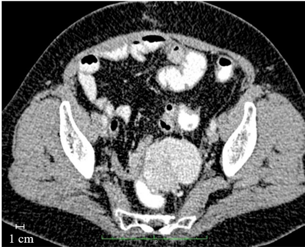
FIGURE 2. This contrast enhanced CT abdomen showing absence of Uterus and ovaries. There is also a well - defined lobulated, avidly enhancing mass within the pouch of Douglas, superior to vaginal vault and upper rectum