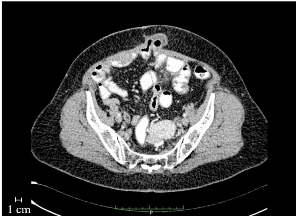
FIGURE 3. This CT image shows enhancing mass in the pouch of Douglas with no evidence of enlarged Elvis lymph nodes. Incidental finding of an anterior lower abdominal wall hernia with a loop of small bowel within