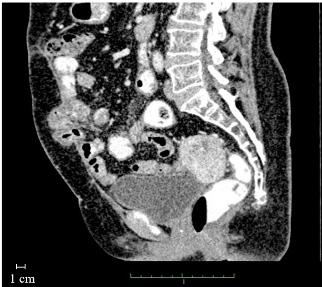
FIGURE 1. This sagittal reformate contrast enhanced CT abdomen shows absence of Uterus. Well-defined lobulated avidly enhancing mass within the pouch of Douglas superior to vaginal vault and upper rectum

A year later, patient was admitted again into the hospital with the same complaint. Subsequent CT study showed recurrence of intra-abdominal mass at the same location as the previous study with partial bowel obstruction (Figure 4). The operation was performed with removing the mass, and the result of histopathology approved multiple benign-appearing smooth muscle tumour in the abdominal cavity, consistent with leiomyomatosis peritonealis disseminata. The pathologic assessment has also showed some evidence of focal mitotically active areas, based on which further follow up was advised.